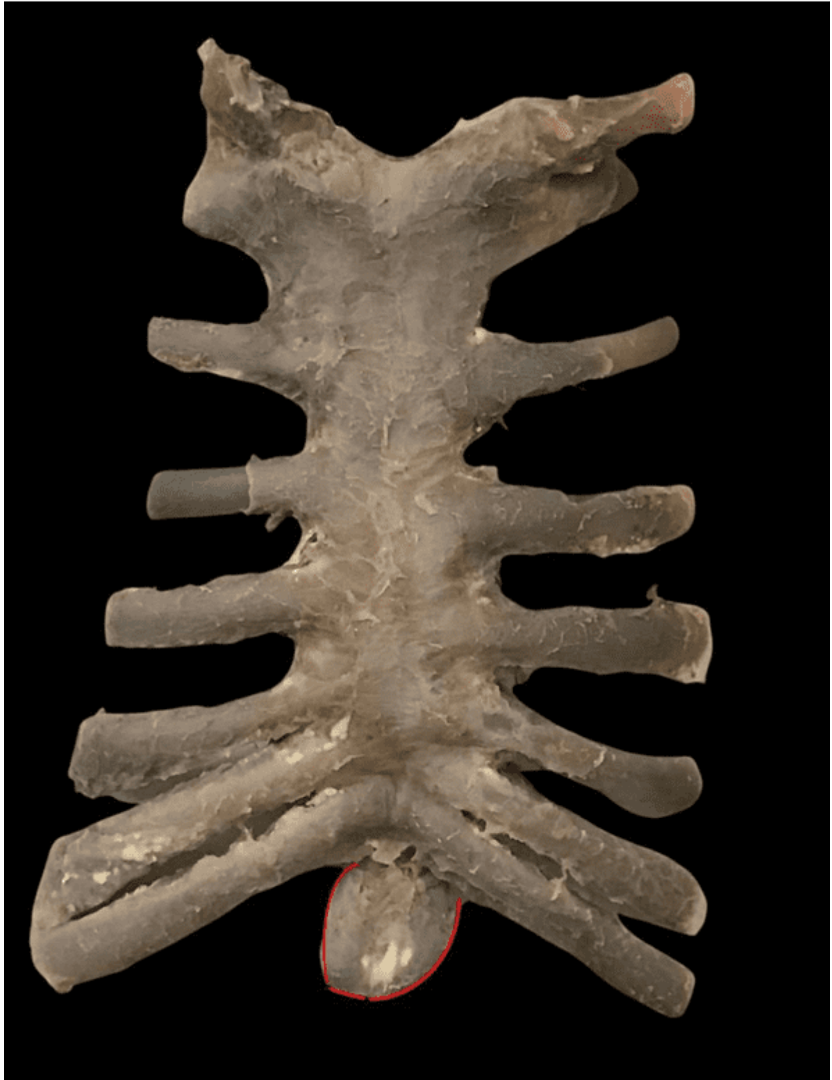
Figure 1. Ventral view of the sternum display a concaveness and angulation of the sternum of the sternum