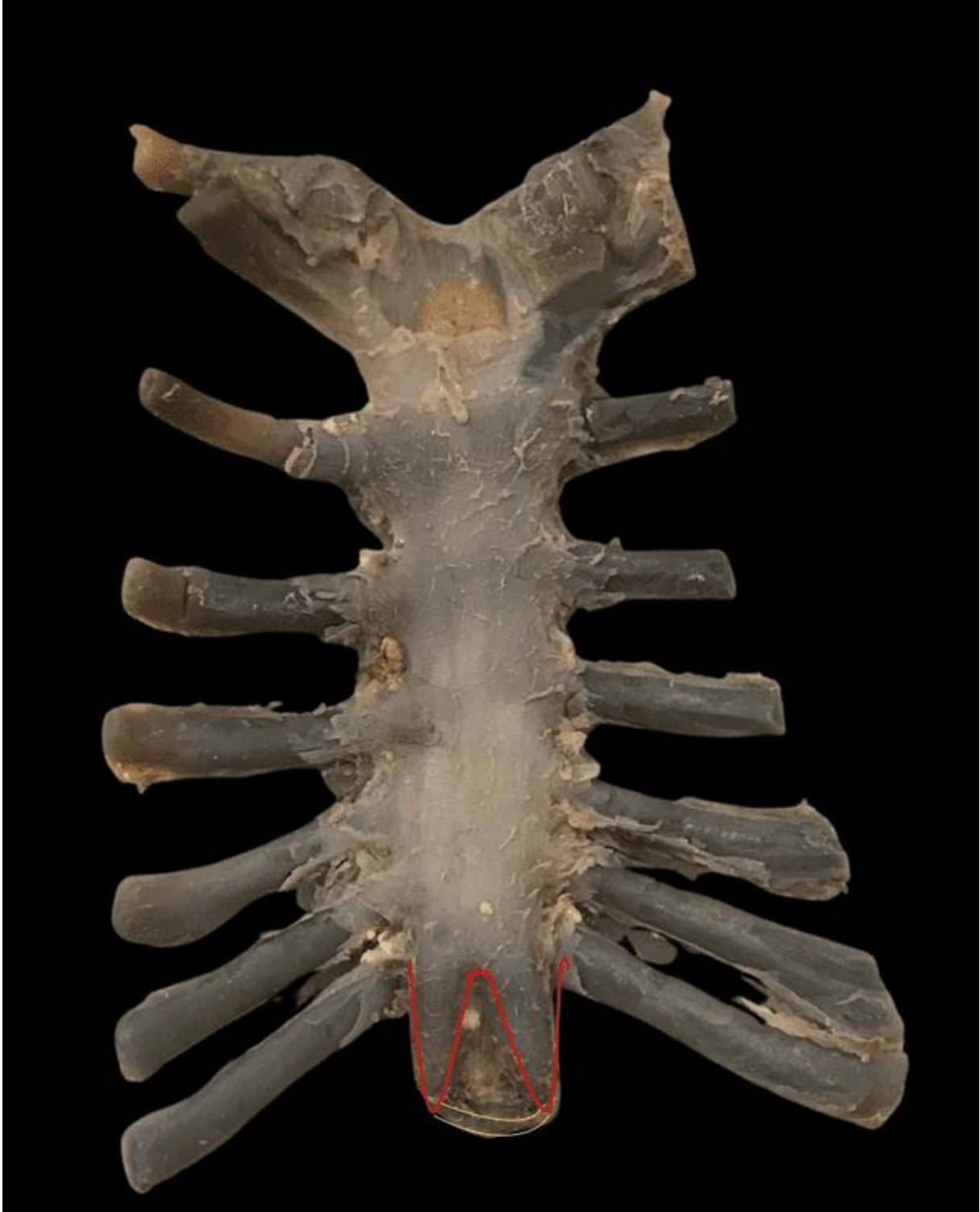
Figure 2. Dorsal view of the sternum showing the two xiphoid processes separated by connective tissue and without a foramen visible to the naked eye